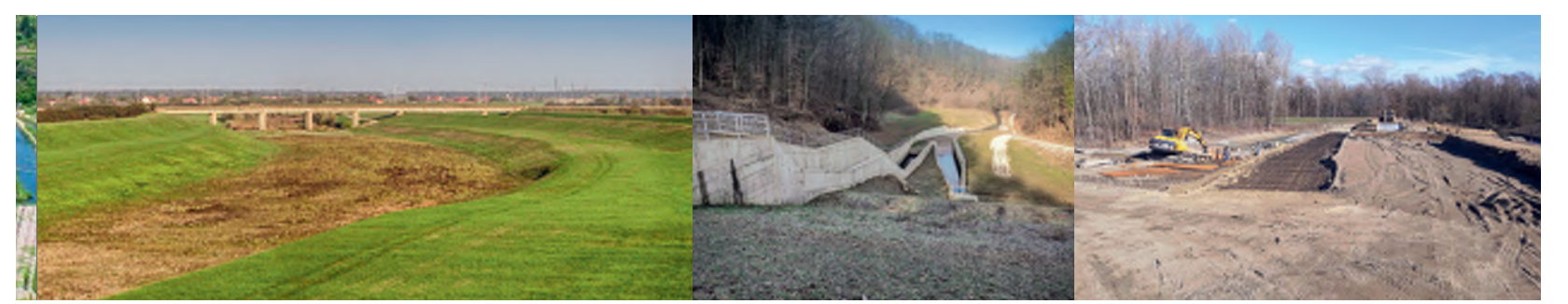
Odra Relief Canal Burnjak Retention Basin Mura River dikes